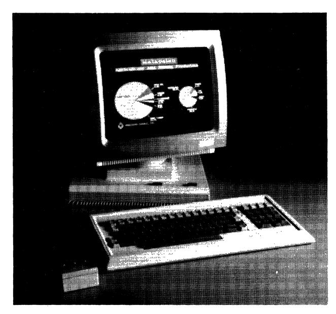
The QVT 511GX is a raster-scan color graphics terminal. It can display text or graphics in up to eight colors, selectable from a palette of 64.

Qume has also made a foray into the graphics terminal market with its three graphics units, the QVT 211GX, QVT and QVT 511GX. All three models combine alphanumerics with graphics display capability. The